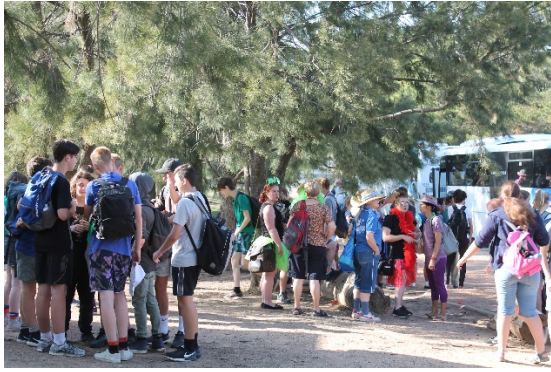
Heading off to the swimming carnival