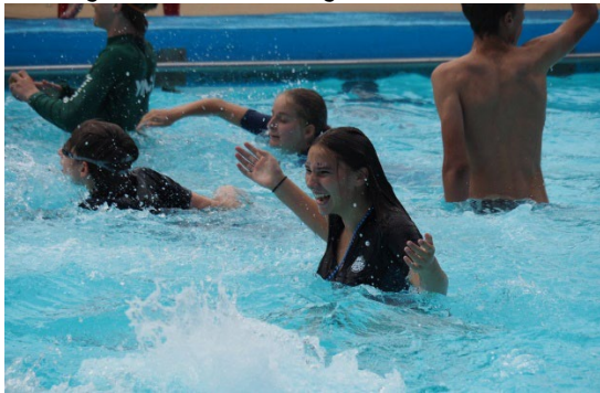
Swimming carnival fun ☺