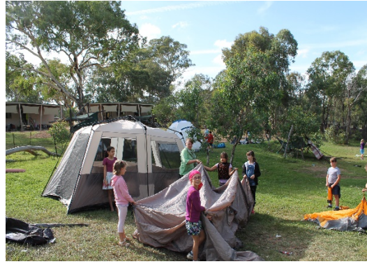
Class 4 practise putting up their tents before camp