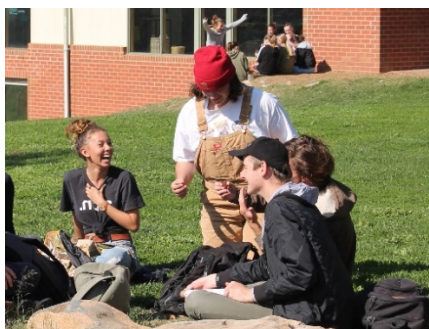
Enjoying the autumn weather