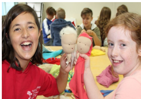
Doll making in class 6