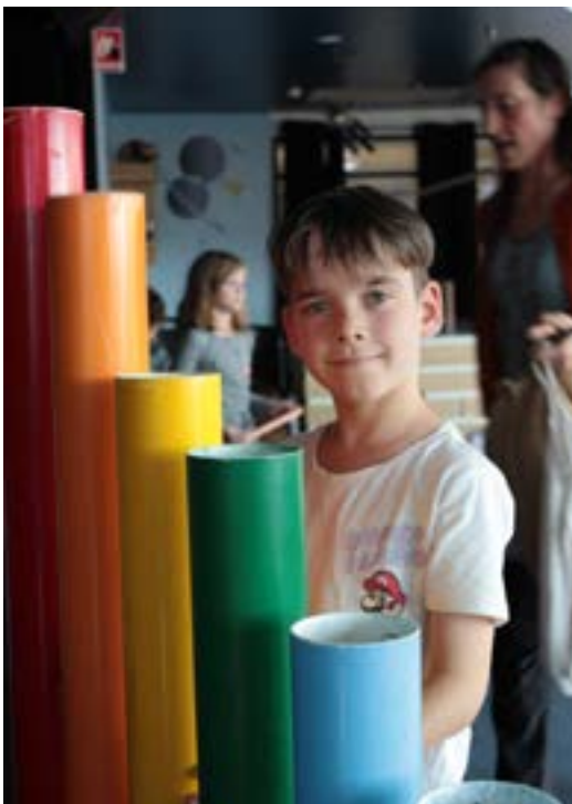
Participant of TAC's Art & Action school holiday program, April 2024.