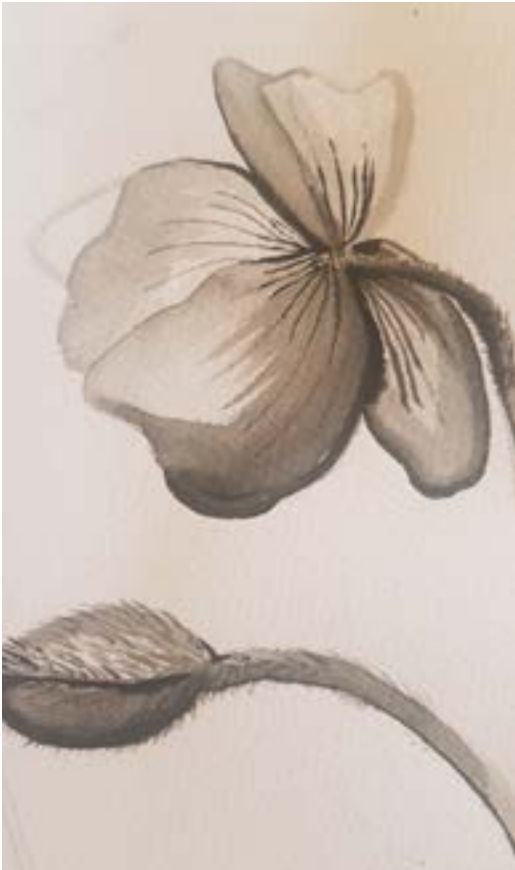
Gina Chapman, drawing, 2024.