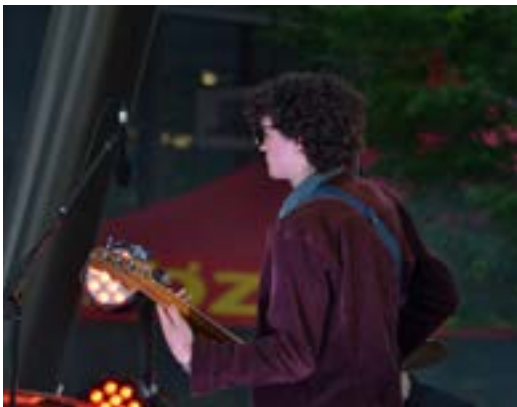
Battle of the Band live gig.