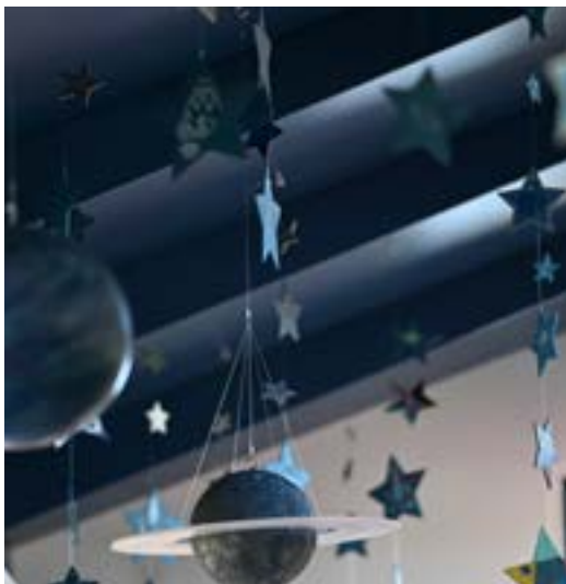
The Space: community star installations and sculptural objects by Tom Buckland.

From music concerts, live theatre and exhibitions, to more hands-on experiences, there really is something to suit everyone. Come and explore our regular art classes for both young and old, or check out our wonderful exhibitions of prints, animation, oil, ceramics, and textiles. Join a choir, laugh at comedy shows, or listen to a recital. We also continue to celebrate our flagship program Fresh Funk with its dance classes, large scale shows, competitions, and development opportunities. TAC's newest program, Turn Up Tuggers is a series of different activities developed, managed and delivered by young people for young people. Check out the re-imagined Battle of the Bands and creative development project, Vinyl Vista .