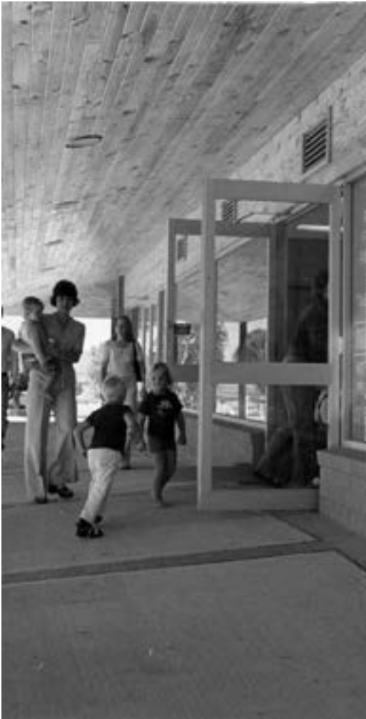
Archives ACT Kambah Co-Op - March 1976 (48 Mannheim Street Kambah) 20112230