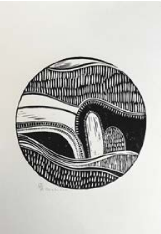
Image: Jamie-Lea Trindall, She is the Rock , lino cut print, 2023.