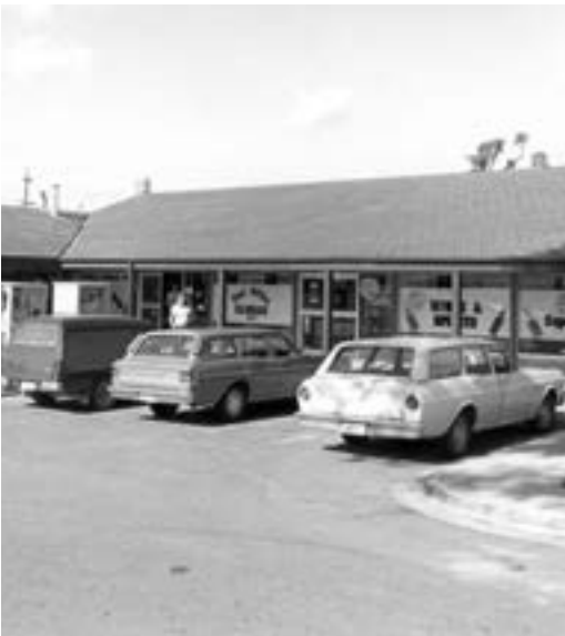
Archives ACT Kambah Co-Op - March 1976 (48 Mannheim Street Kambah) 20112230