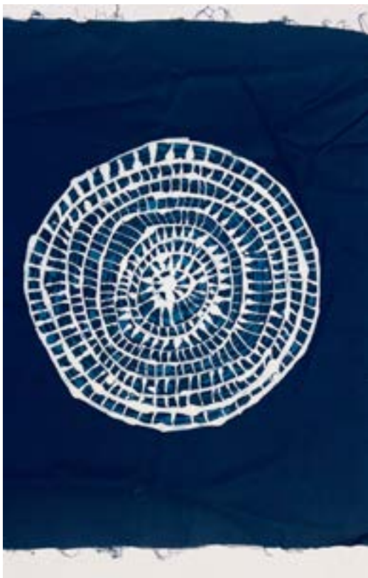
Image: Rechelle Turner, Waybali , Batik 2024.

Exhibition showing until 10 August Free, all welcome.