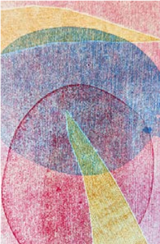
Peter McLean, woodblock print with stencils, 2023.