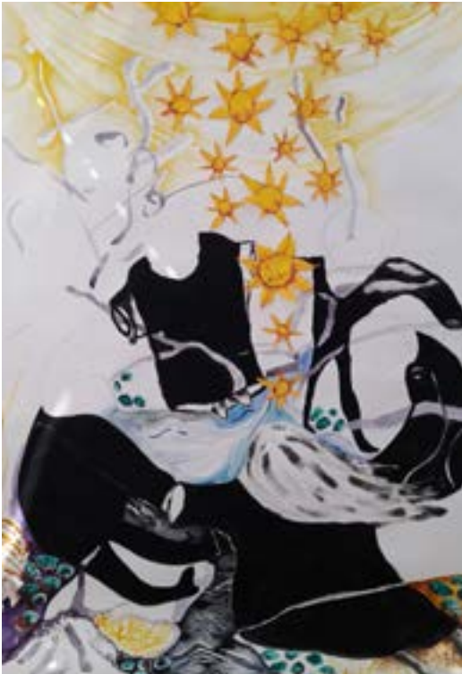
Heidi Smith, Pine Island Sprites , black and white study, ink on paper, digital print, dimensions variable.