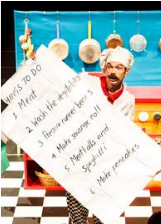
Signor Baffo - Worboys Productions