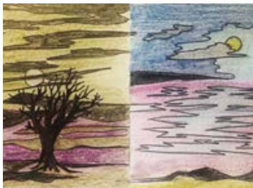
Barak Zelig, Day and Night sketches, 2024.