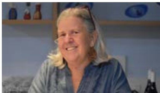
Dimity is one of the volunteers at TAC.

Volunteers need to have a Working with Vulnerable People card (it's free for volunteers and applied for via Access Canberra). If you are interested in becoming a key part of the TAC team, drop into the Centre and have a chat and pick up a registration form. All volunteers are provided with an induction and training.