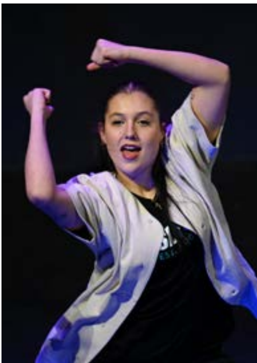
Fresh Faced Young Choreographers initiative, 2023.